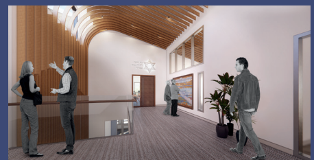
Bright, open upper level with a new Shul, a roof garden, and dedicated spaces for volunteers and therapeutic day program participants.