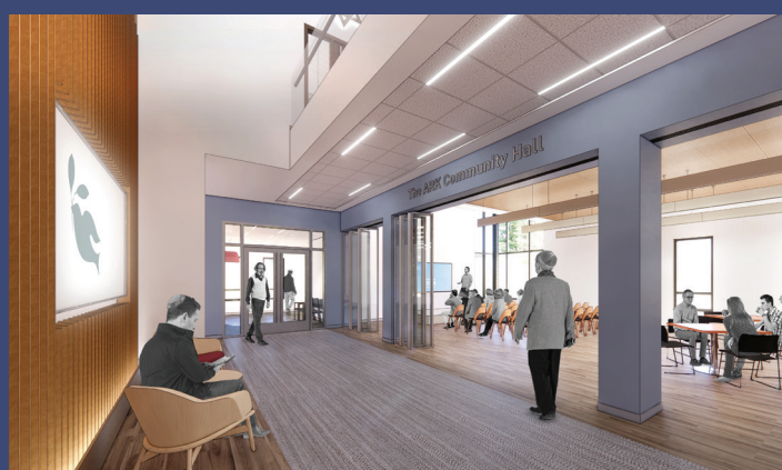
Dedicated Community Room will provide space for 100 to enjoy warm meals, educational programs, and community events.