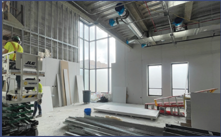
Interior work is proceeding quickly, and the building will be completed and ready to open in early 2024!