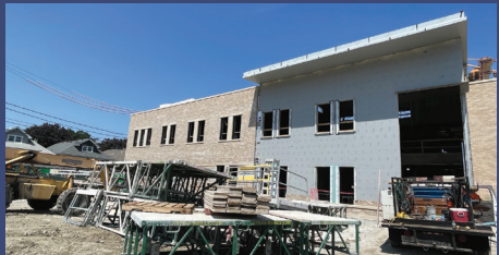
By April, the team had begun building out interior spaces as well as the roof of the new building, while work inside the Seymour Persky building proceeded more quickly.