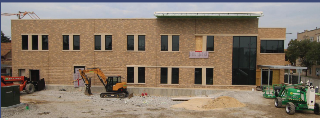
Over the summer, we completed the exterior of the building, including masonry, roof, and windows, and the team was hard at work on the installation of plumbing, electrical, and more.