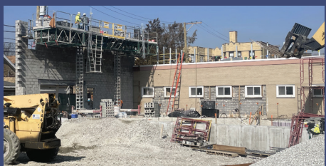
In December, the foundation for the addition was poured, and in January, the team began to construct the exterior walls of the new building.