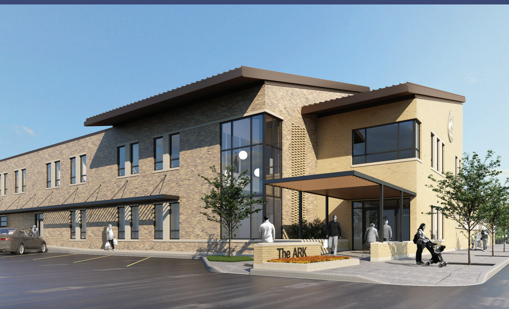
Expanded physical footprint will make it possible to serve at least 1,000 more clients each year.

New and expanded spaces at The Ark will have a profound impact for our clients.