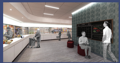
Larger, more inviting food pantry will allow clients to shop with dignity or offer easy pick-up as well as more access to fresh, nutritious kosher food.