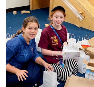
School and synagogue groups pack presents for Chanukah

and Northbrook locations. Our pantry programs operate under a "Client Choice" model where individuals and families can select their preferred groceries, including meat, dairy, eggs, and more, for on-site pickup or home delivery. We also provide a range of household and