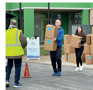
Volunteers organize kosher food at The Ark warehouse

and F.R.E.E. Synagogue, we proudly resumed hosting bimonthly opportunities for dozens of clients to come together, share a meal, and take home a packaged lunch for the next day.