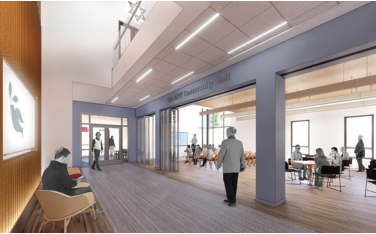
Atrium and Community Room