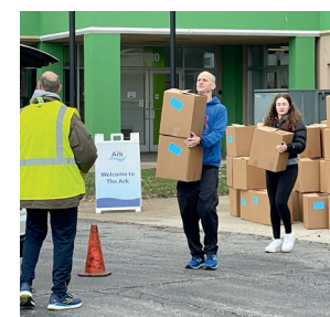
Volunteers organize kosher food at The Ark warehouse

and F.R.E.E. Synagogue, we proudly resumed hosting bimonthly opportunities for dozens of clients to come together, share a meal, and take home a packaged lunch for the next day.