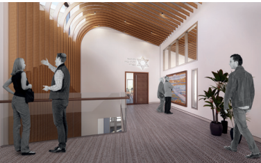
Second Floor, Shul and IDP space

In 2022, The Ark broke ground on the transformative renovation and expansion of our longtime home in West Rogers Park. This landmark project will create a warm and inviting new space for Ark clients and staff, which honors our commitment to uplift our clients with the dignity they deserve. To date, The Ark has raised more than $21 million through the Building Our Future Campaign , to fund the renovation, bolster The Ark’s endowment, and invest in innovative new programs. Through the support of the community, we will: