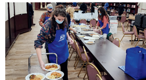
Café Ark brings the community together for a warm meal and connection twice a month