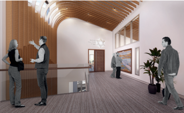
Second Floor, Shul and IDP space