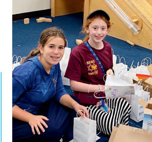
School and synagogue groups pack presents for Chanukah

and Northbrook locations. Our pantry programs operate under a "Client Choice" model where individuals and families can select their preferred groceries, including meat, dairy, eggs, and more, for on-site pickup or home delivery. We also provide a range of household and