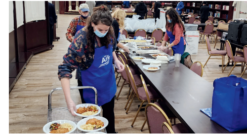
Café Ark brings the community together for a warm meal and connection twice a month